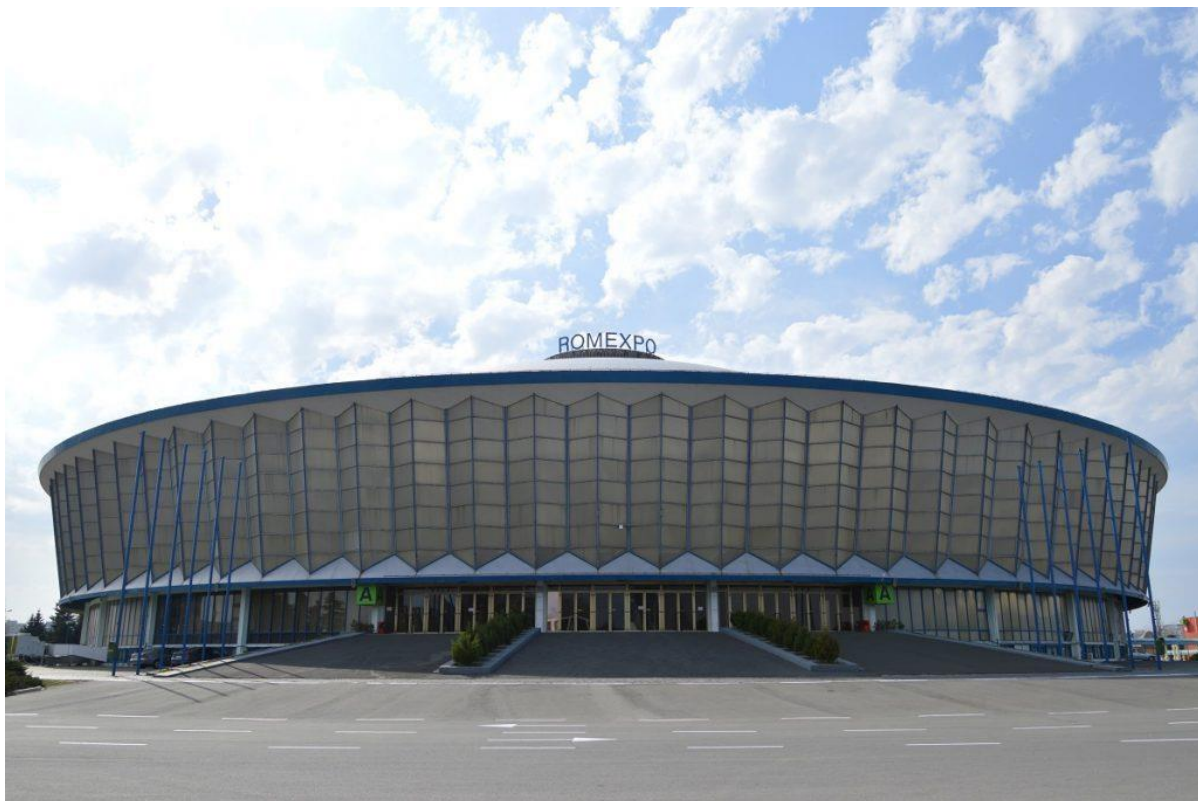
Figure 1: Conference Center Romexpo, Bd. Mărăști no. 65-67, sector 1, Po Box 32-3, Postal code 011465, Bucharest