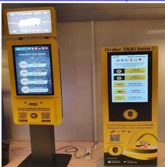
Figure 2: Touch screen terminals present at the Henri Coandă International Airport to order a taxi